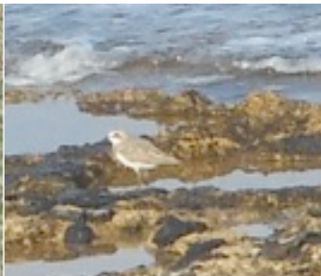
Greater Sand Plover